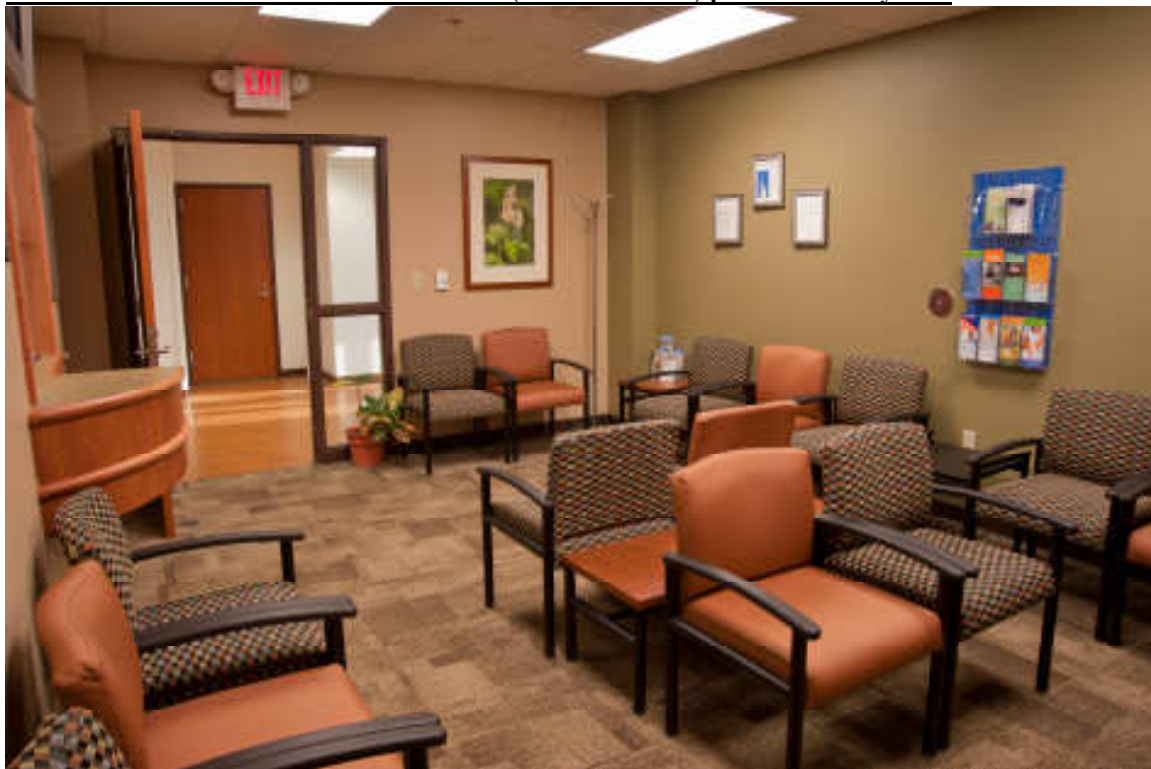
Northwest Healthcare- Medical Offices (KAI Architects)