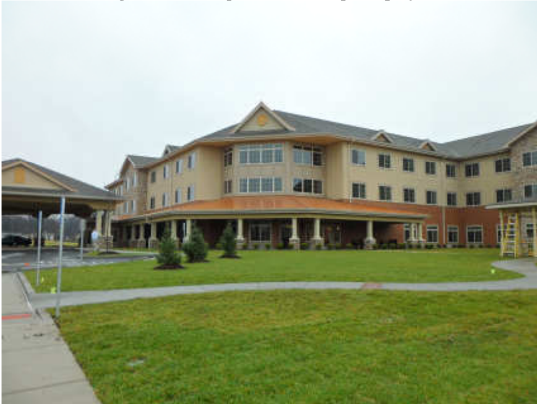
Garden Plaza- Assisted Living Units: Picture courtesy Answers, Inc. Architects

The Building Department worked with Answers, Inc. on a new Assisted Living Center now called “The Bridge”, the second phase of a three phase project: