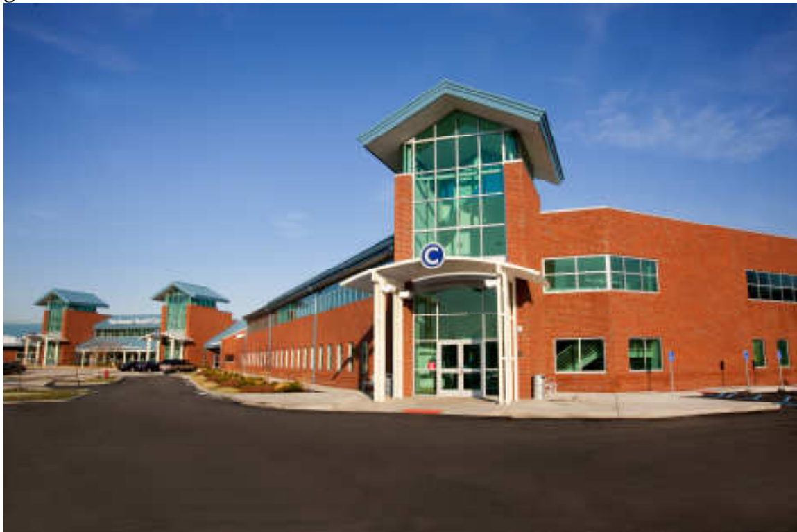
Northwest Healthcare- Medical Offices (KAI Architects)

Construction inspections were completed for the following projects and occupancies granted: