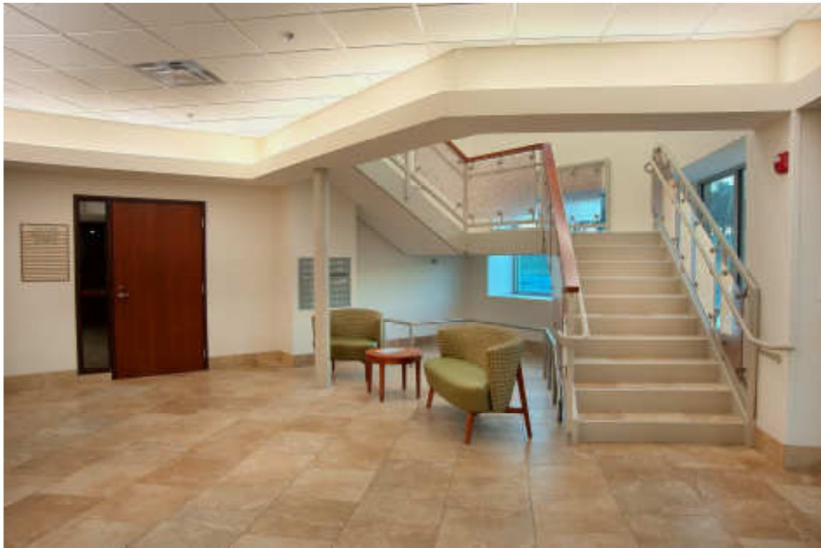
Northwest Healthcare- Medical Offices (KAI Architects)