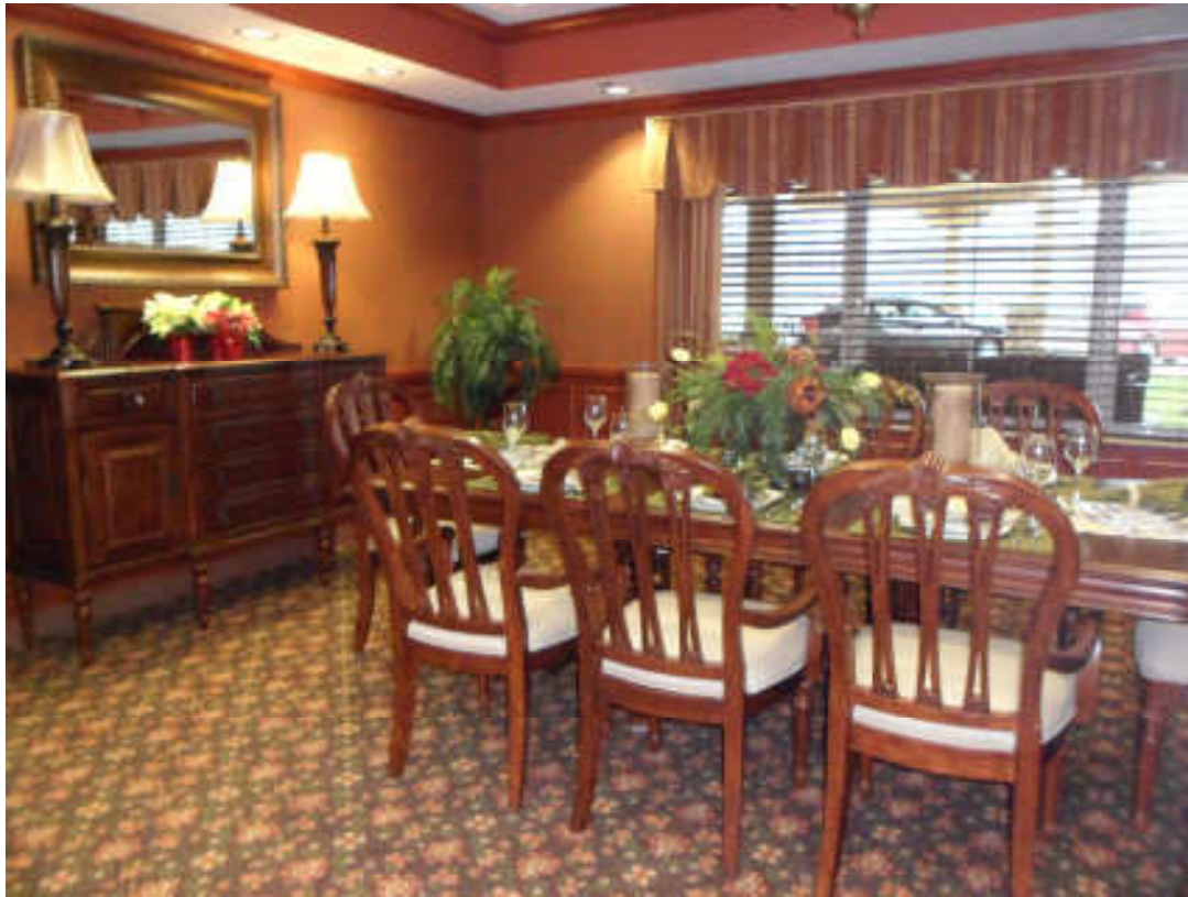
Garden Plaza- 'The Bridge' Dining Center: Picture courtesy Answers, Inc. Architects

Construction inspections were completed for the following projects and occupancies granted: