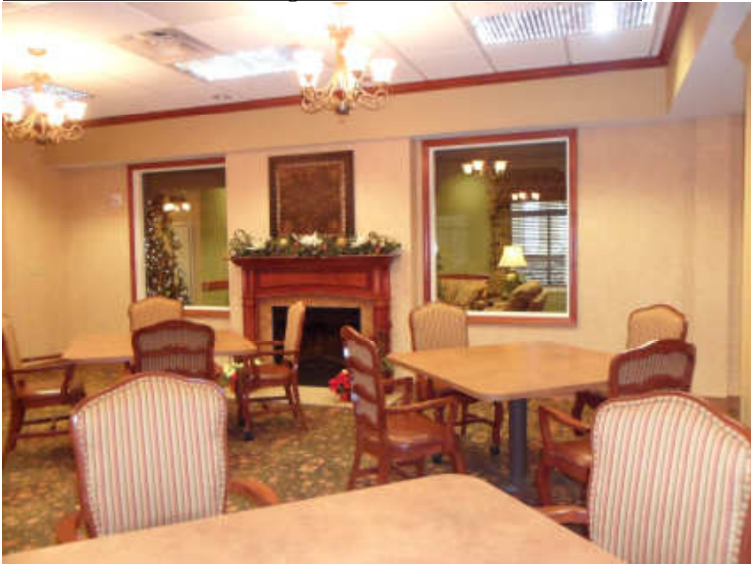
Garden Plaza- ‘The Bridge’ Dining Center: Picture courtesy Answers, Inc. Architects