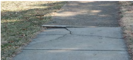
Sidewalk with trip hazard

Requests for sidewalk repairs are taken throughout the year. The deadline for the "2009" Sidewalk Program is March 31, 2009. The Sidewalk Program goes out for bid each year and is awarded to the lowest and most satisfactory bidder. Sidewalk requests are investigated and those that qualify are measured/spray painted for repair. In mid summer the repair process begins. The slabs in violation are removed and the area to be replaced is formed in which new concrete is placed followed by site restoration.